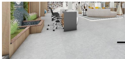
Vitrified tiles of size = 800mmx800mm