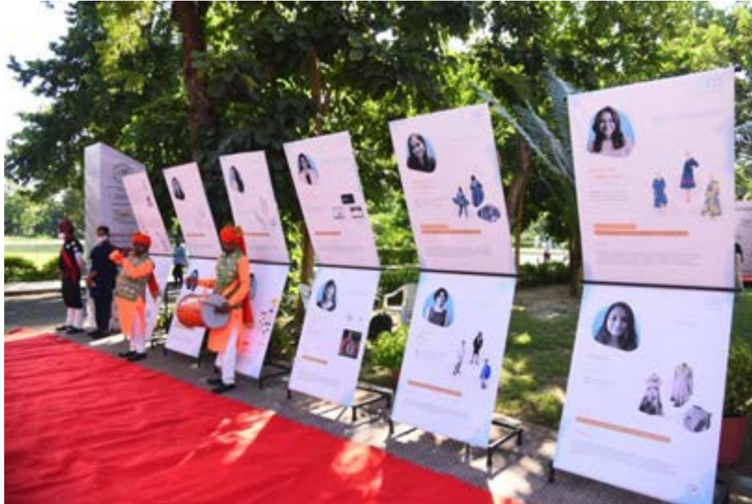
Display of Graduating Students' work at venue