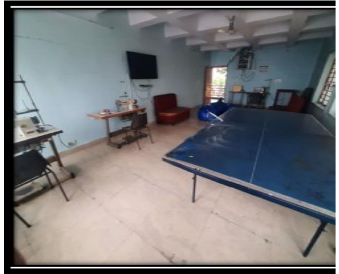
SEWING MACHINES & COMMON ROOM