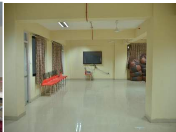
SEWING MACHINES AND RECREATION HALL