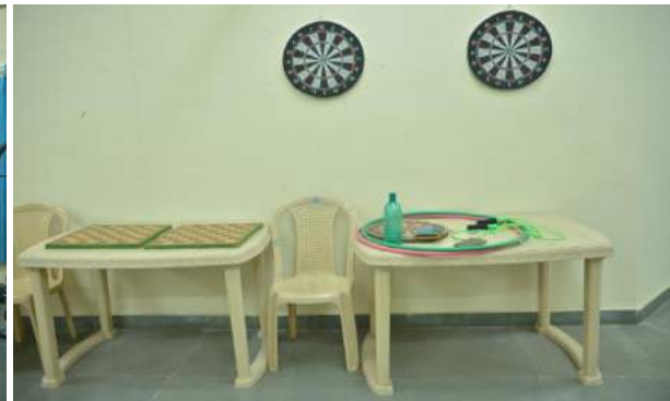
GYMNASIUM AND INDOOR GAMES AREA