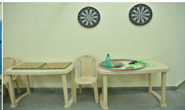
Gym and indoor games