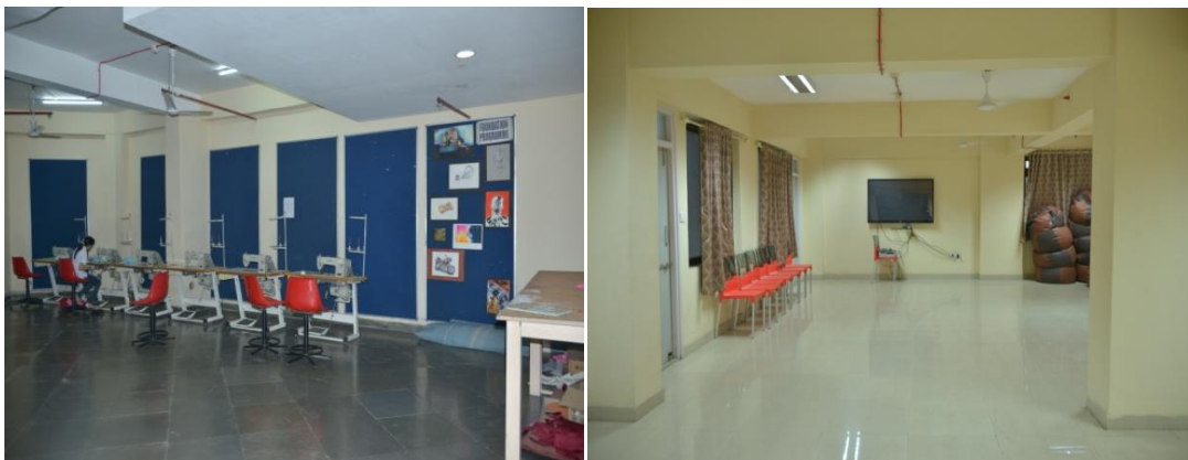
Sewing Machines and Recreation Hall