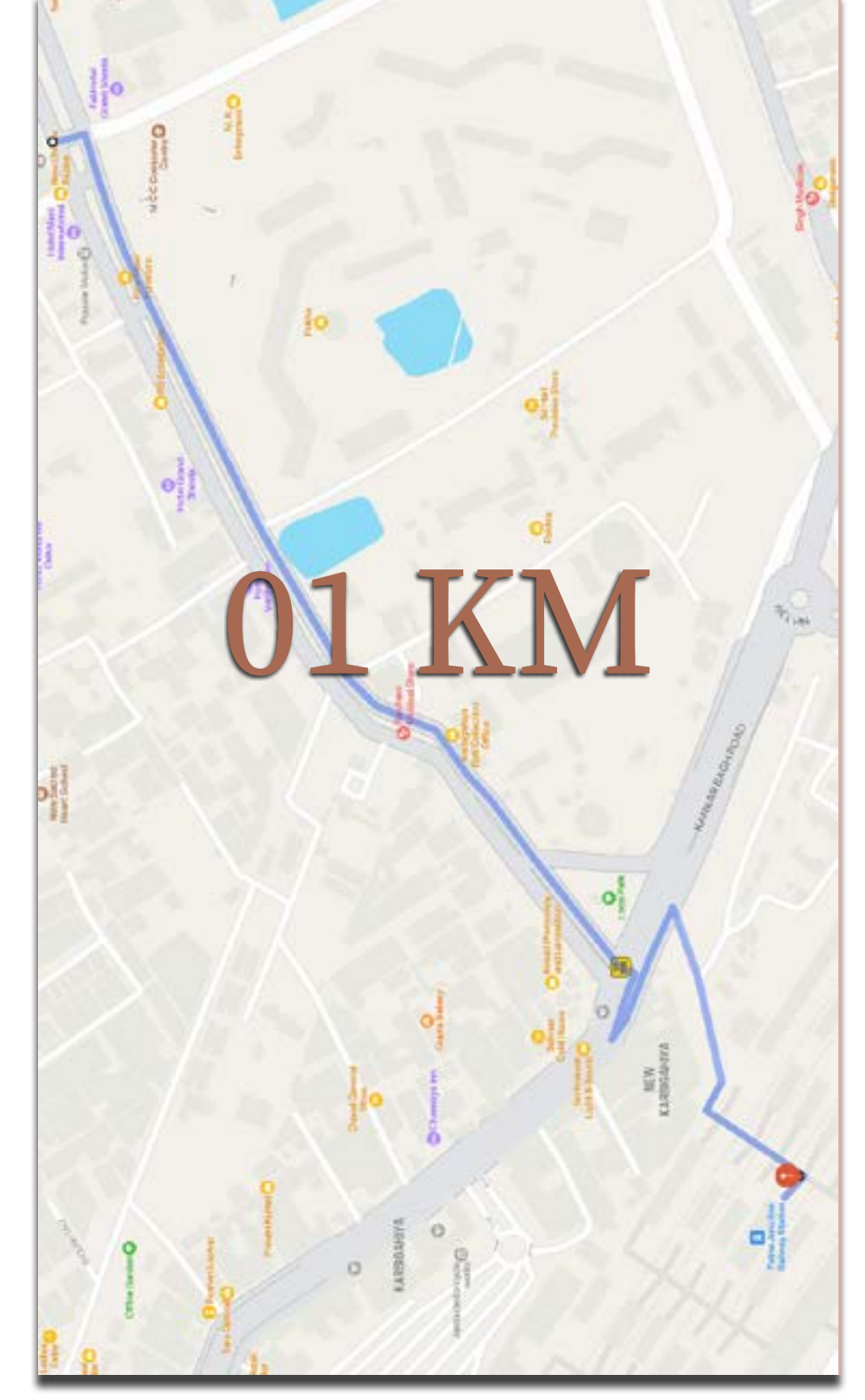
FROM PATNA RAILWAY STATION

Five minutes from Transport: Taxi/ Th (10-12 minutes)