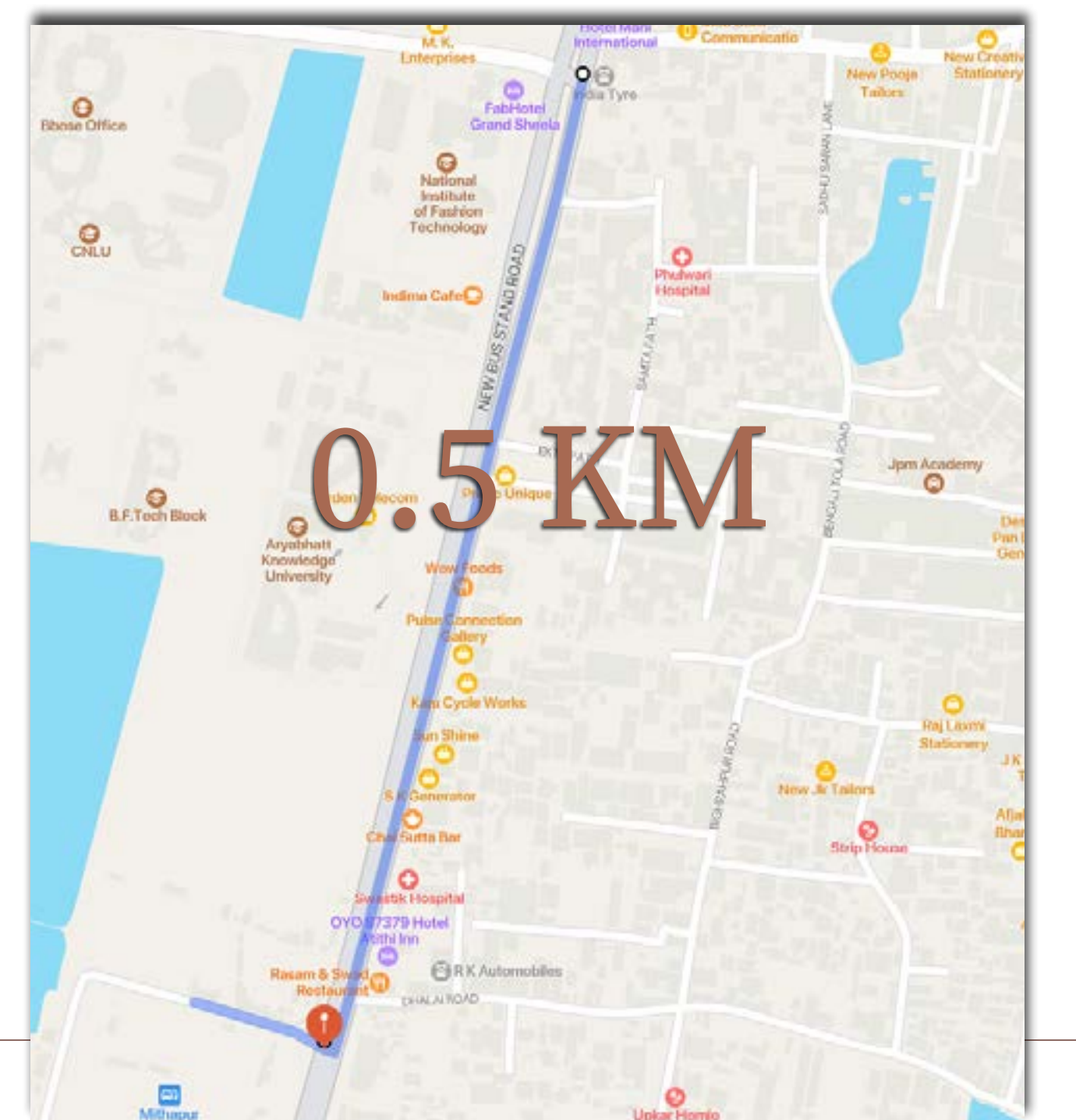
Two minutes from Three wheelers/B B U \mathcal{O} 0