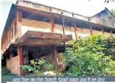
जसर स्थित लेदर फैक्टरी, जिसमें अबका सेंटर में यह सेंटर

मध्य प्रदेश गवर्नमेंट और इंडस्ट्रियल इन्फ्रास्ट्रक्चर डेवलपमेंट कॉर्पोरेशन (आईआईडीसी) के सहयोग से इसे शहर के मुरार स्थित लेदर फैक्टरी में बनाया जाएगा। करीब चार मंजिला के इस सेंटर की तैयार करने में लगभग 12 करोड़ रुपए की लागत आएगी। इस प्रोजेक्ट का ड्राफ्ट तैयार कर लिया गया है, जिस पर संभवतः नए साल से काम शुरू हो जाएगा।