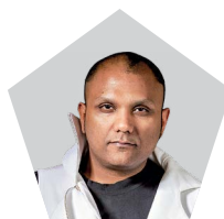
GAURAV GUPTA (2000) Known for giving the conventional saree a contemporary makeover