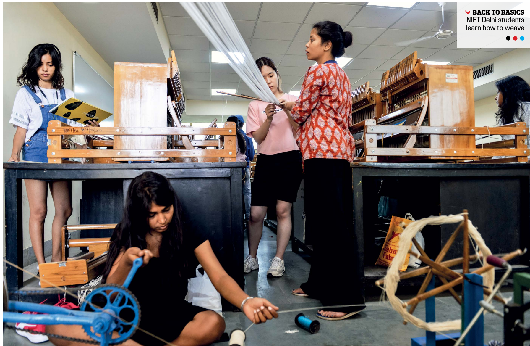
✓ BACK TO BASICS NIFT Delhi students learn how to weave