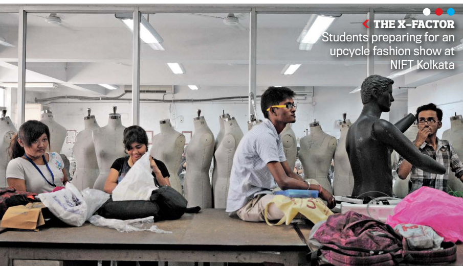
THE X-FACTOR Students preparing for an upcycle fashion show at NIFT Kolkata